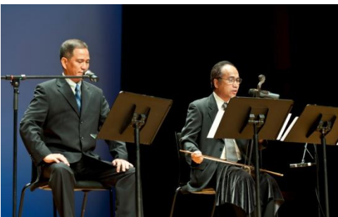
Chinese Opera Singing