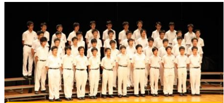
S2 Chinese Choral Speaking