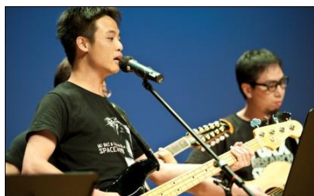
Alumni from 1966 – 2011 Singing Medley