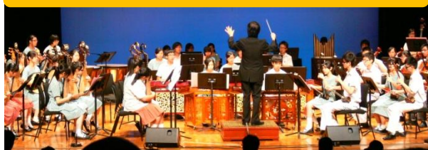
Joint School Chinese Orchestra Programme (TMGSS & TWGSS)